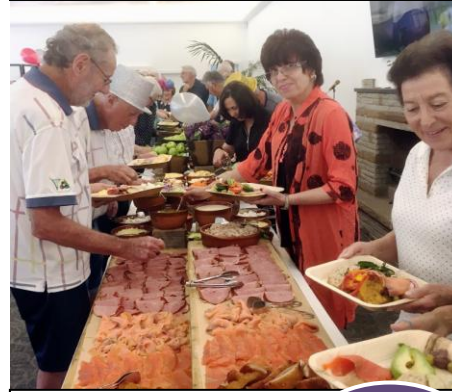
Luncheon is served