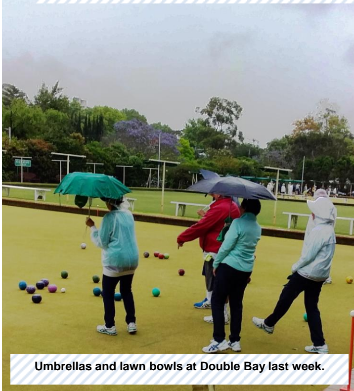
Umbrellas and lawn bowls at Double Bay last week.

DOUBLE Bay members lost more than a half an afternoon of bowling due to rain last Wednesday, November 7.